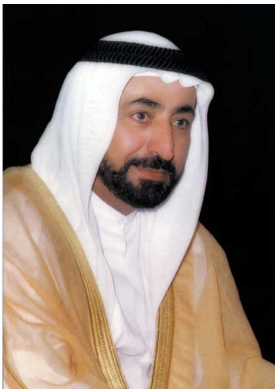
His Highness Sheikh Dr. Sultan Bin Mohammad Al Qassimi

Supreme Council Member, Ruler of Sharjah Founder and President of American University of Sharjah