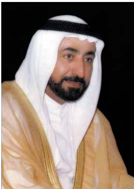
His Highness Sheikh Dr. Sultan Bin Mohammad Al Qassimi

Supreme Council Member, Ruler of Sharjah Founder and President of American University of Sharjah