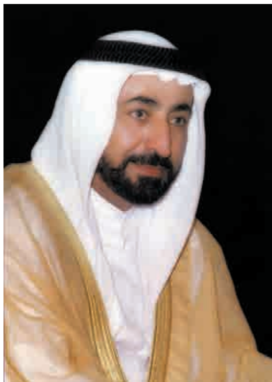
His Highness Sheikh Dr. Sultan Bin Mohammad Al Qassimi

Supreme Council Member, Ruler of Sharjah President of American University of Sharjah