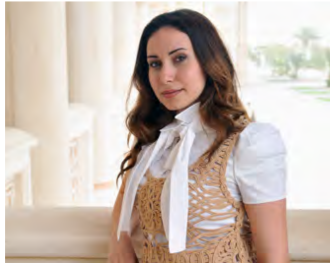
Dhabi for the complete architectural design of a complex villa using the Vastu system of building and spiritual energies.

The Cityscape Young Architect of the Year Award in 2008, which was a phenomenal personal achievement and an accomplishment dear to my heart. Also, the BP Innovative Design Award, and most recently the Luxurious Villa Design Award, which was a competition offered by ELG Group in Abu