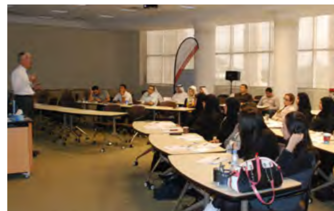
AUS Alumni Association Board and Council members at the workshop

The agreement outlines a number of areas of mutual collaboration and lists possible initiatives in this regard. The MoU will facilitate partnership on a wide range of endeavors and will also offer alumni, graduating seniors, post graduate students, leadership program students, and executives within the community at large opportunities to attend a training workshop to be offered by the PSOW twice a year on the AUS campus. The workshops will focus mainly on training the various constituencies mentioned above on internationally-accepted standards and skills that will enhance career and professional expertise.