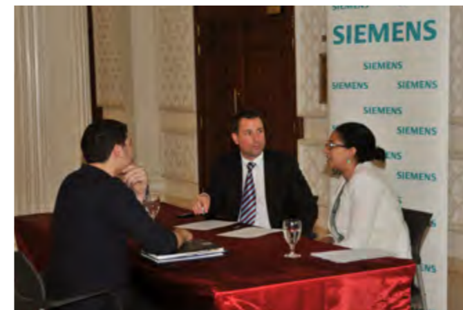
Siemens Middle East