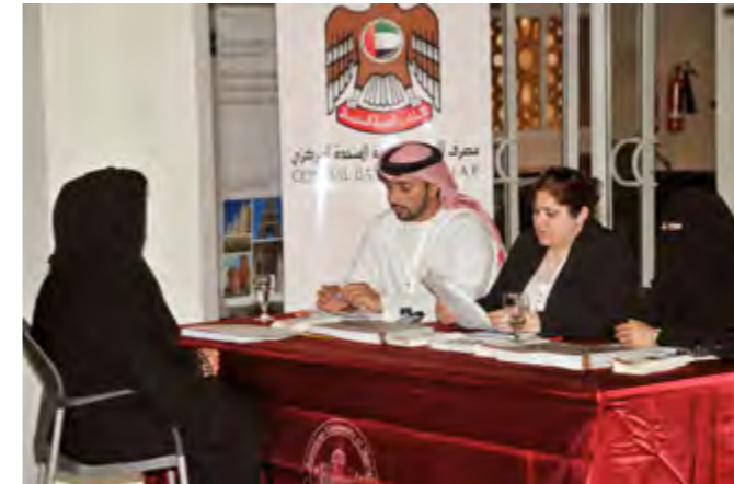
Central Bank of UAE