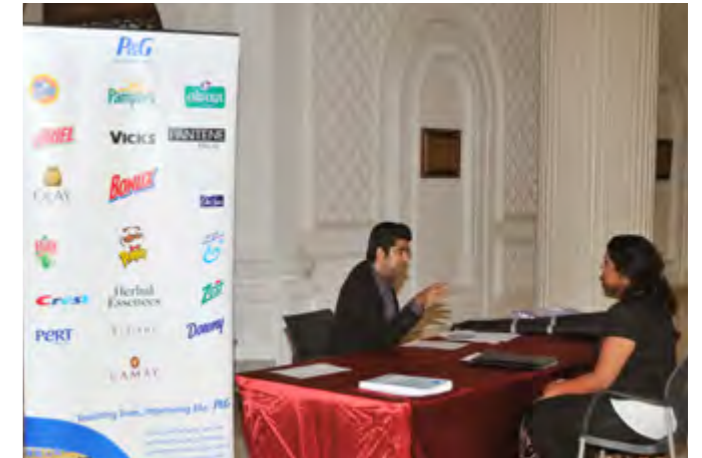
P&G Middle East