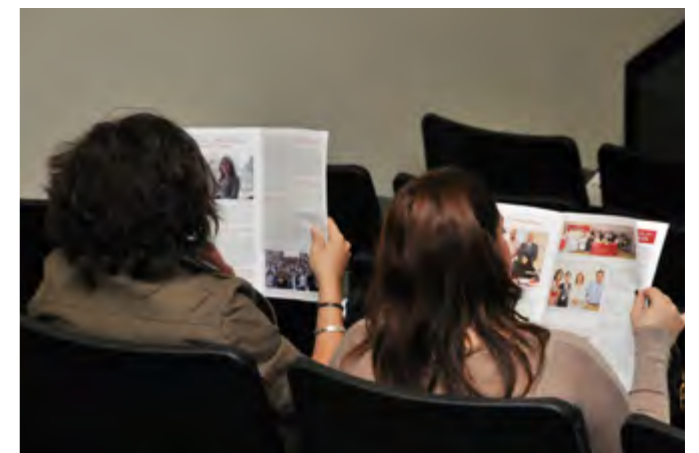
Members of the AUSAA Council flipping through the pages of AUS Connect