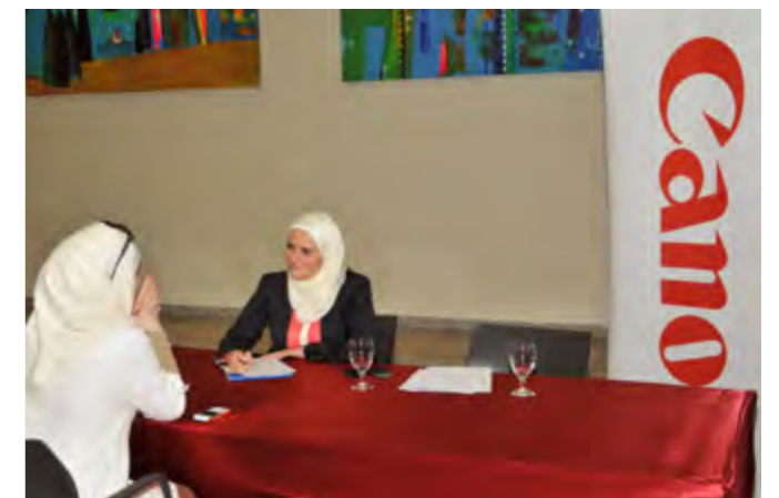
Canon Middle East