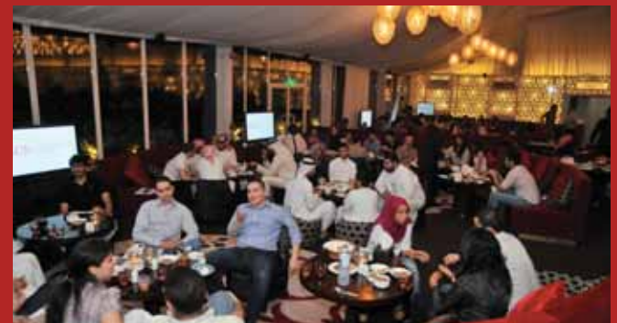
Guests at the Dubai Suhoor