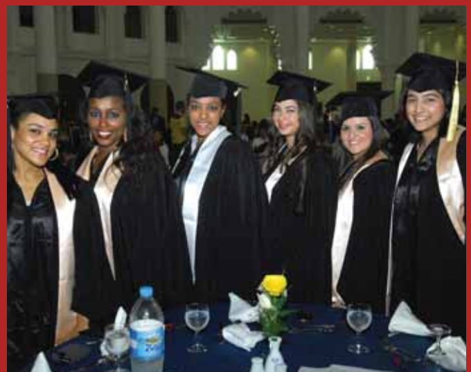
Alumnae at the Luncheon