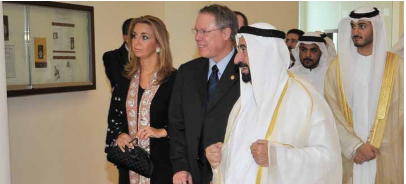
His Highness Sheikh Dr. Sultan Bin Mohammad Al Qassimi tours Al Darah with AUS Officials