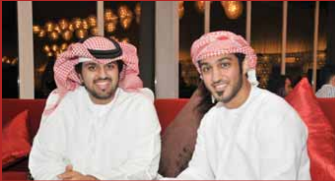
Guests at the Dubai Suhoor