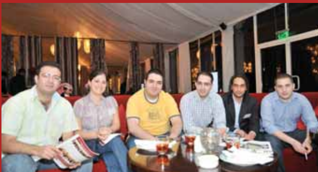
Guests at the Dubai Suhoor