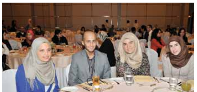
Part of the audience