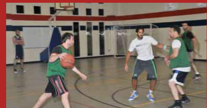
Second Annual Ramadan Sports Tournament