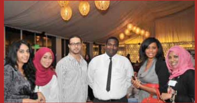
Guests at the Dubai Suhoor