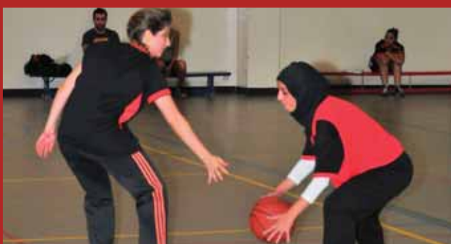
Second Annual Ramadan Sports Tournament