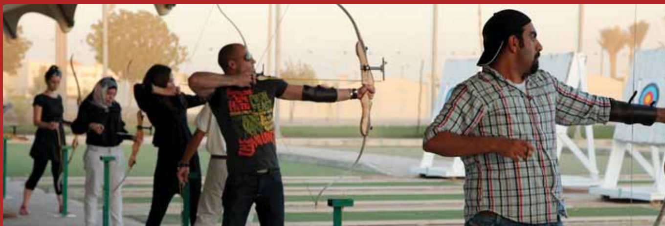
AUSAA Council members during the retreat activities