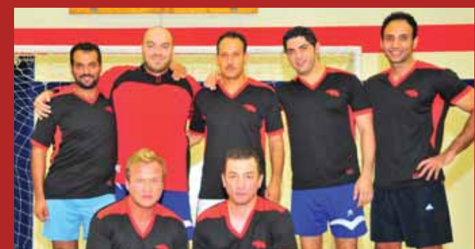
Second Annual Ramadan Sports Tournament