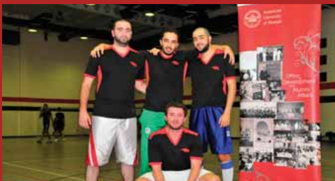
Second Annual Ramadan Sports Tournament