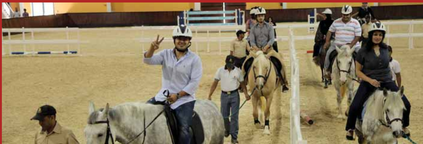
AUSAA Council members during the retreat activities