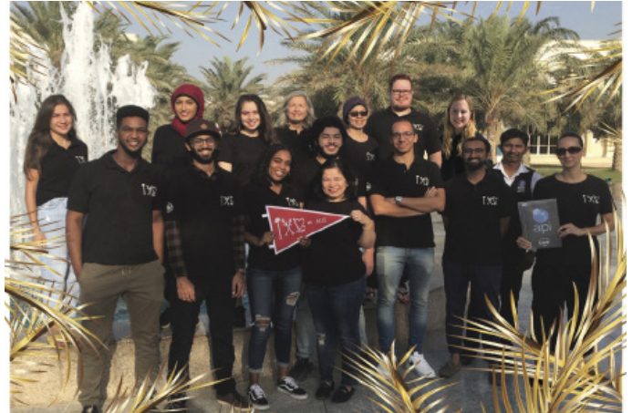
IXO Team Fall 2018