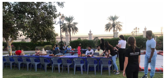
Moments from the International Day of Tolerance 2018