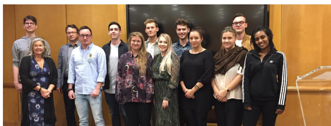
Design management students from Salzburg University