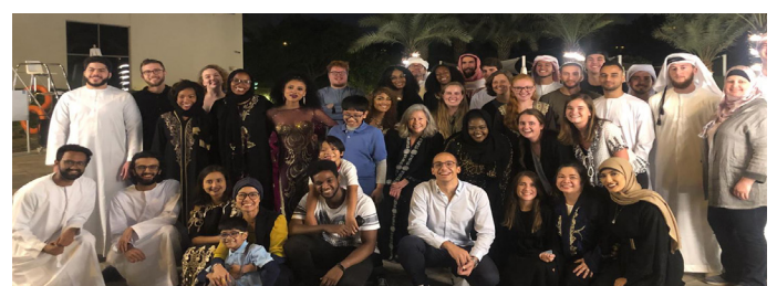
Exchange Students during the Thanksgiving Dinner

IXO hosted a farewell Thanksgiving dinner at the Centro Hotel in Sharjah, an official event to say goodbye to the students who studied at AUS this Fall 2018. We wish our fall cohort a safe return journey and request that they stay in touch.