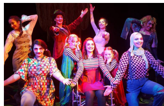
Moments from Cirkus