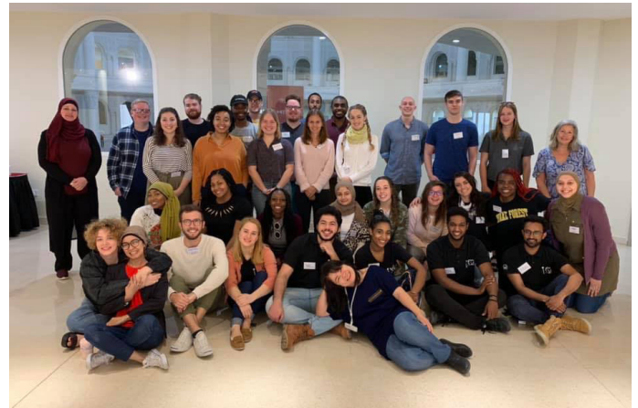
Incoming Spring 2019 Cohort

The IXO Team wishes the AUS Community all the very best for the spring semester.