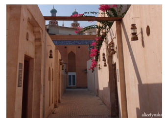
Some of Alice's Photography in Sharjah from alicetynska.com