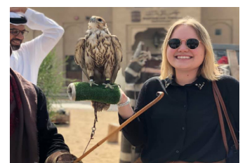
Holding a Falcon