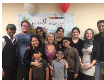
Members of Our Team Celebrate Nine Years of IXO

On January 2, we celebrated nine years since the establishment of the International Exchange Office (IXO). Since its formation in 2010, IXO has advised thousands of AUS students about a variety of international opportunities including study abroad, graduate programs, summer programs, international internships, and international scholarships.