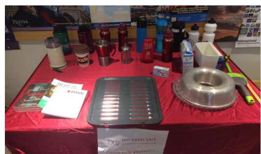
Items on Display at the Yard Sale

We thank our Fall 2018 students who generously donated items to this semester's "yard sale." Every semester, we collect items, such as clothes hangers and kitchen supplies, from those students who are returning home, and provide them via our "yard sale" to new incoming study abroad students. This orientation activity means new students don't have to start from scratch in setting up their dorm room.