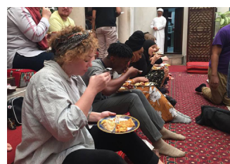
Traditional Emirati Lunch

Our incoming students received an intensive orientation program to familiarize them with the UAE and Emirati culture and heritage. The orientation program included cultural and informational sessions, a traditional mandi lunch, and trips to the Arabian Wildlife Center, the Heart of Sharjah, the Sheikh Mohammed Centre for Cultural Understanding, Etihad Museum, the Dubai Mall and Kite Beach.