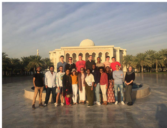
Michigan State University Students with IXO Team Members

Members of our team gave a campus tour to a group of visiting Michigan State University (MSU) students. Our team showed them around the various facilities here at AUS. We hope they enjoyed their time here.