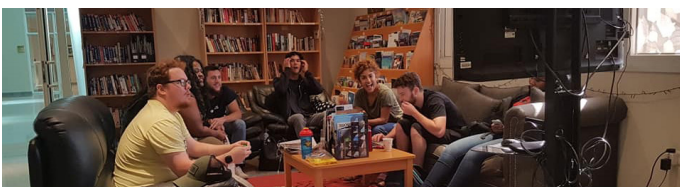
Exchange Students Enjoying a Game Day

Our study abroad students, along with some of peer advisors, enjoyed a fun Game Day in the IXO lounge before preparing for their final exams. This allowed them to de-stress before final exam week.