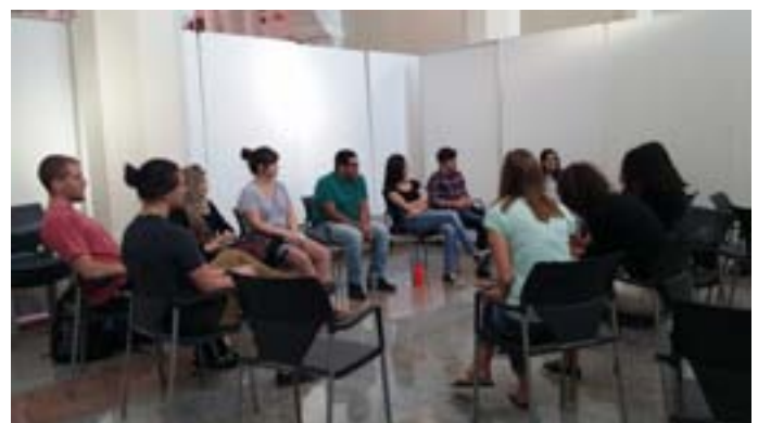
Spring 2016 incoming study abroad students at IXO Mixer

IXO recently held a gathering that included the recently returned AUS students who studied abroad in Fall 2015, inbound study abroad students who are currently studying at AUS for the Spring 2016 semester, and AUS students who will be studying abroad in Fall 2016. During this session, students engaged in cultural discussions and shared stories about their study abroad experiences.