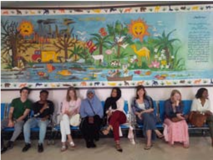
Spring 2016 incoming study abroad students at the Sharjah Arabian Wildlife Centre

During IXO orientation week, the Spring 2016 exchange students visited many places in Sharjah, such as the Sharjah Heritage Museum, the Blue Souk, Al Qasba and the Sharjah Arabian Wildlife Centre. They also visited the Dubai Museum, had a cultural breakfast at the Sheikh Mohammed Centre for Cultural Understanding, and took abras across the Dubai Creek and visited the Gold and Spice Souks in Deira, Dubai.