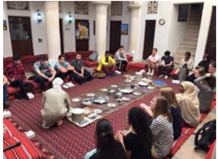
Spring 2016 incoming study abroad students at the Sheikh Mohammed Centre