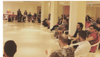
IXO Mixer Attendees

The IXO Mixer aimed to facilitate direct interactions between new incoming study abroad students and AUS faculty, staff and students. The mixer, held during the second week of the semester, incorporated ice breaker games and a shared meal. Representatives from the Egyptian, Palestinian, Pakistani, Jordanian and Indian cultural clubs; International Student Club; CAS faculty members; and other friends of IXO joined. The attendees also enjoyed cultural performances by AUS students.