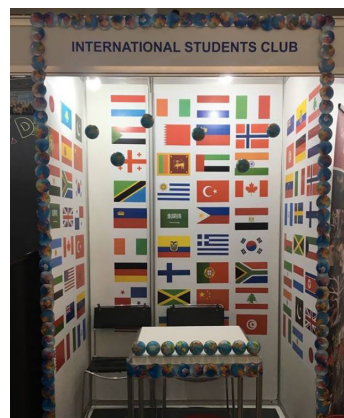
International Students Club Booth

AUS recently celebrated its cultural diversity during the Fall 2018 Club Fair. The two-day event featured 74 cultural and interest-oriented clubs, including the International Student Club. The exchange students had a wonderful time pursuing their personal interests outside the classroom and helping the club board members to decorate their booths. The students also enjoyed cultural performances, music and food. We love to see our study abroad students participating in AUS clubs.