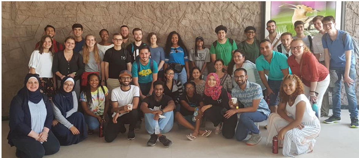
IXO Fall 2018 exchange students in the Arabian Wildlife Center