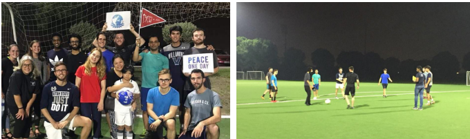
IXO students during the Peace One Day Charity Match

IXO students participated in a Peace One Day Charity Football Match organized by the AUS Bridge Program. The newly formed IXO team played two matches against the Bridge Program team while members of IXO and the Achievement Academy cheered them on.