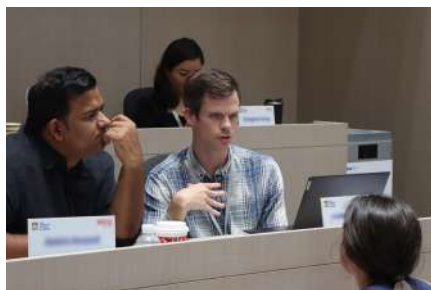
Participants engaging in interactive classroom discussions