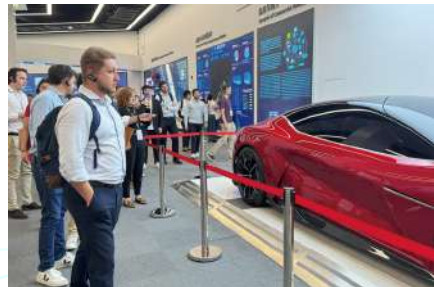
VIP corporate groups visiting top-tier Chinese tech giants - Tencent and BYD