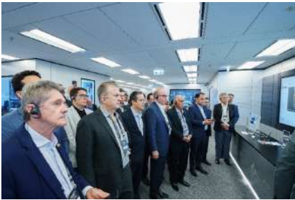
C-suite executives exploring AI innovations firsthand at SenseTime (Hong Kong)