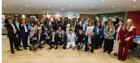
Senior executives experiencing the pulse of AI at Alibaba (Hong Kong)