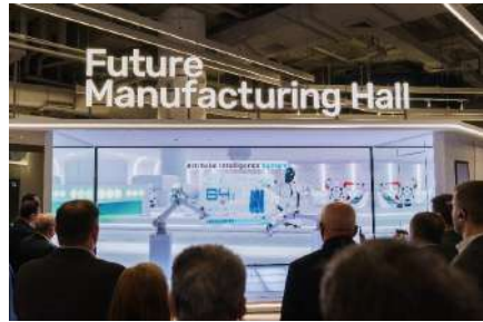
Global leaders observing future technologies at the Hong Kong Productivity Council