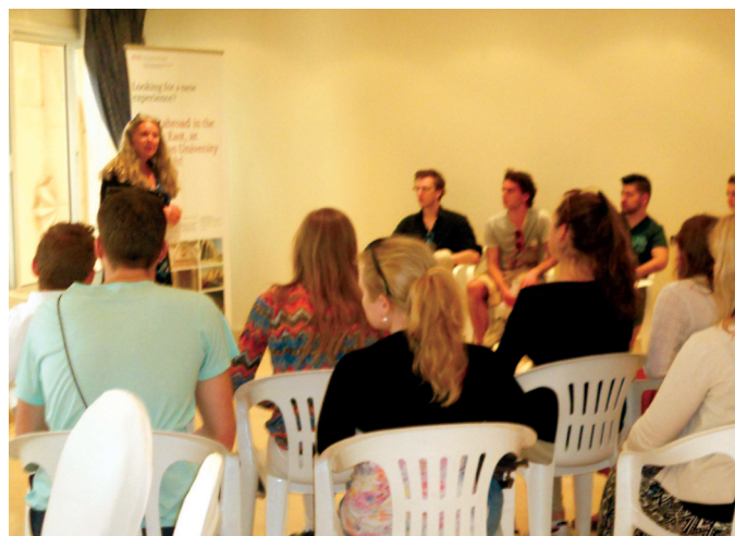
The visiting delegation from Tilburg University

They also attended the International Studies Student Association (INSA) conference, which focused on global migration and Middle Eastern political, cultural and social relations.