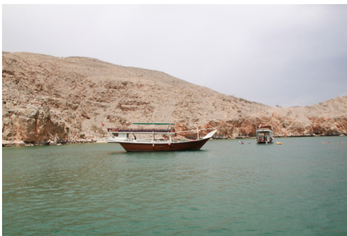
Dhows in Musandam, Oman