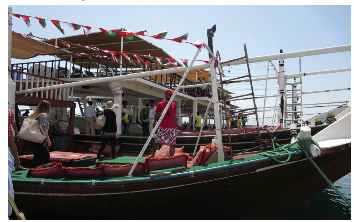
Incoming Spring 2015 exchange students in Musandam, Oman

IXO recently hosted an outing for the Incoming Spring 2015 exchange students to Musandam, Oman. The students spent a day on a traditional wooden dhow and enjoyed the beautiful scenery and swimming.