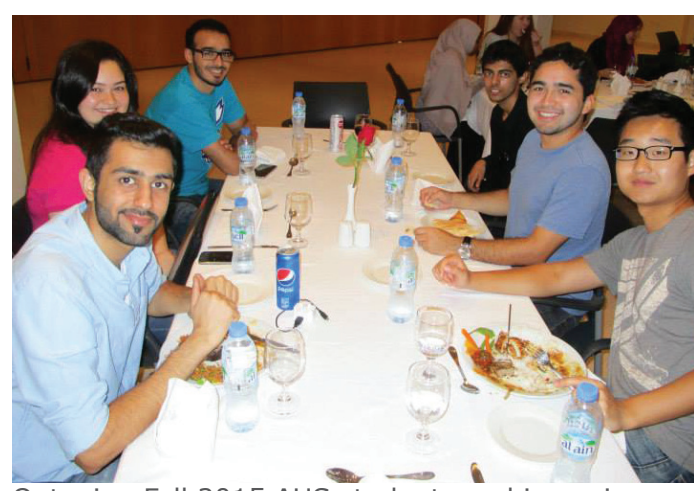
Outgoing Fall 2015 AUS students and incoming Spring 2015 exchange students at the predeparture dinner

IXO wishes the Fall 2015 outgoing students a wonderful semester abroad!