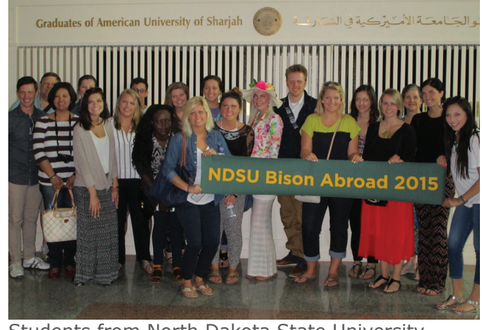
Students from North Dakota State University

IXO recently hosted a visiting delegation from North Dakota State University, North Dakota, US. The students were excited to visit the UAE and take a tour of the AUS campus.