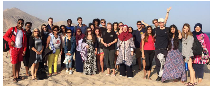
IXO students in Musandam, Oman