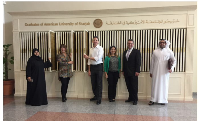
Delegates from Stanford and Khalifa universities