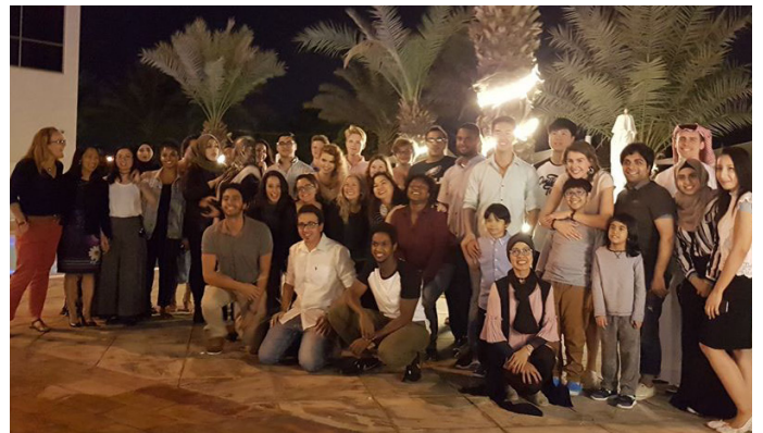
IXO Team, Alumni and Students

IXO hosted an American-style Thanksgiving dinner with roasted turkey at the Centro Hotel, Sharjah. The dinner also served as IXO's official farewell to the students who studied at AUS this semester. The IXO Team wishes all students a safe return journey. We will miss them dearly.