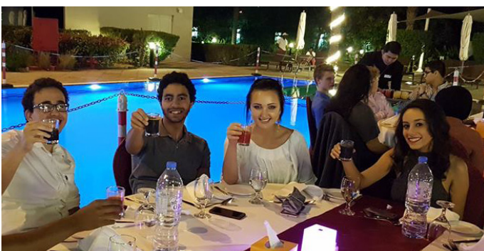
Students and Peer Advisors Enjoying Dinner