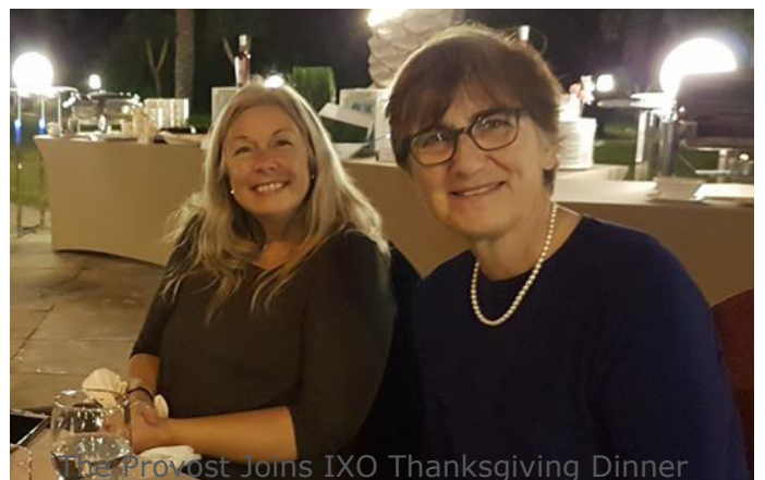
The Provost Joins IXO Thanksgiving Dinner