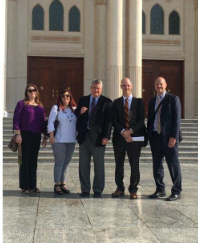
Delegates from East Carolina University