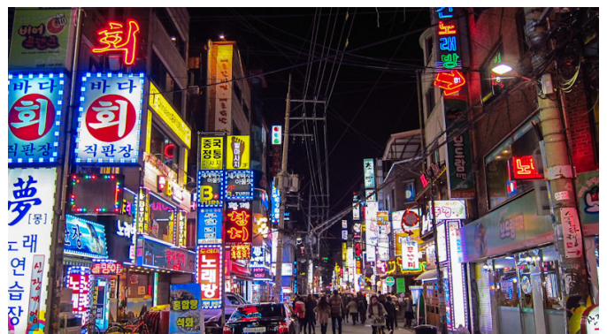
Konkuk University's Kondae neighborhood

If you are interested in studying abroad, visit our office (MG50) or contact us at ixo@aus.edu .