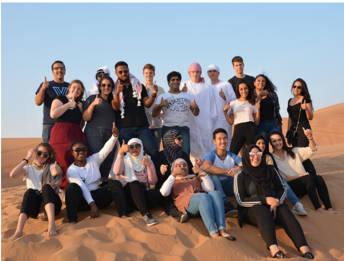
IXO Students Enjoy the Desert

IXO organized a trip to the desert where students enjoyed local nature and the warmth of a bonfire under the stars.