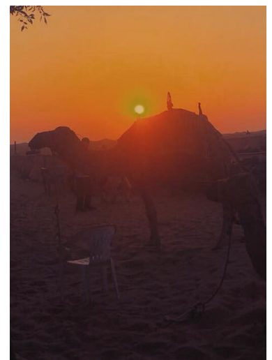
Sunset Over the Desert