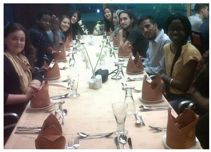
Fall 2014 Exchange Students at the Sharjah Golf and Shooting Club

IXO celebrated a wonderful Thanksgiving dinner before the break at the Sharjah Golf and Shooting Club. Students got to indulge in a traditional Thanksgiving meal of stuffed turkey and gravy.