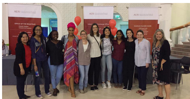
IXO team meets incoming Spring 2017 students