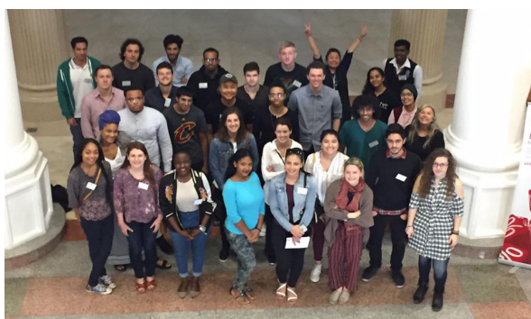
Incoming Spring 2017 students

IXO would like to welcome all the new incoming Spring 2017 students! IXO planned a specific orientation for these students so that they could learn about and understand the UAE culture. The nine-day orientation program included talks about culture and life in the UAE, and trips to museums both in Dubai and Sharjah, the Heart of Sharjah area, old souks in Dubai, malls and other local attractions.