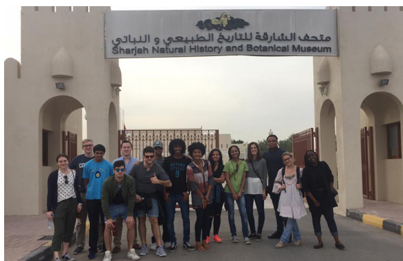
Incoming Spring 2017 students at the Sharjah Natural History and Botanical Museum