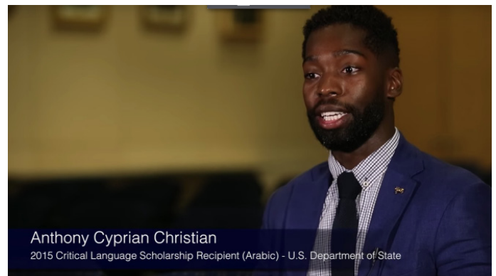
Video Title: The Importance of Language Skills and Global Competencies