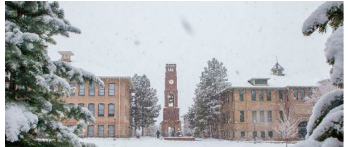
Southern Utah University Campus