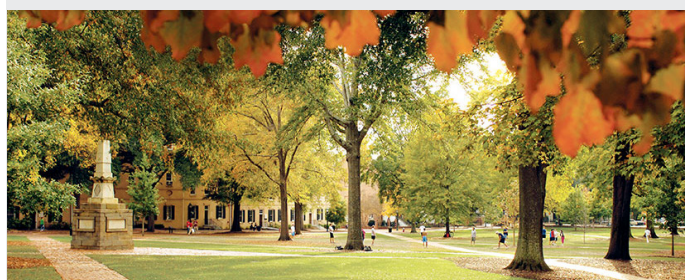
University of South Carolina Campus