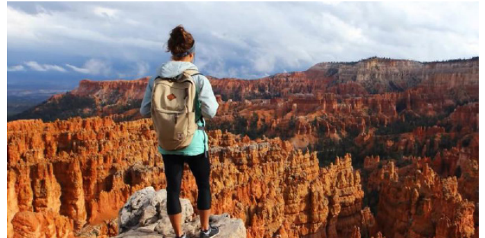
Southern Utah has many beautiful national parks