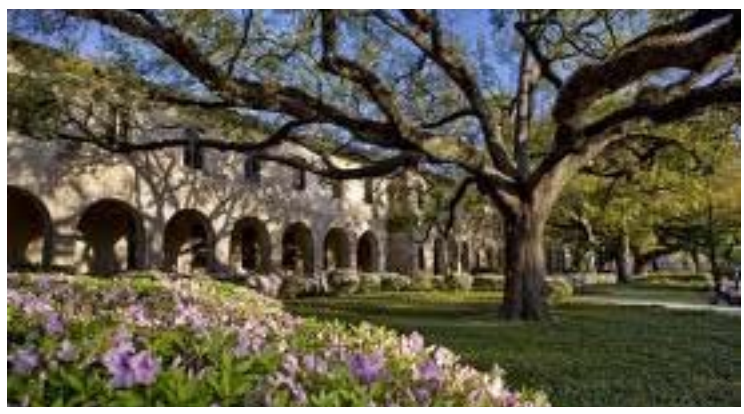
Louisiana State University Campus

For more information, please visit the IXO office in the Main Building, office MG-43.