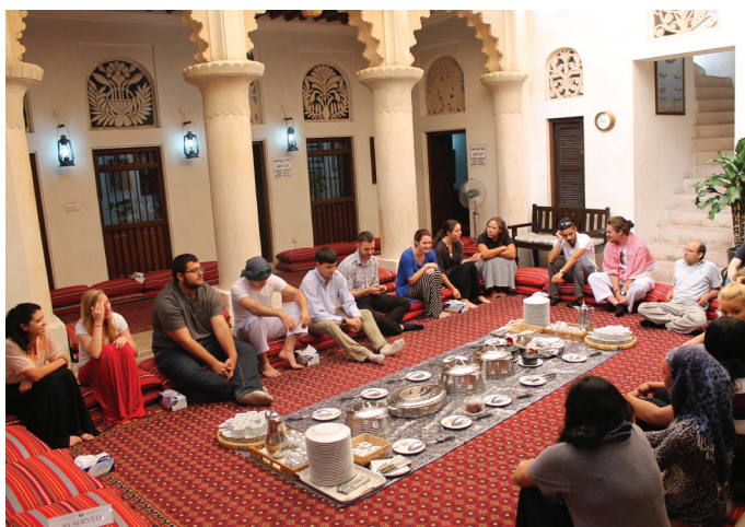
Sheikh Mohammed Centre for Cultural Understanding