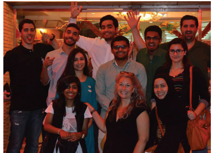
Dinner for IXO peer advisor graduates