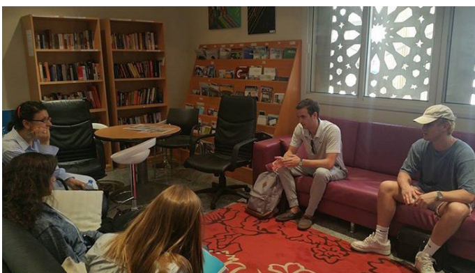
Mixer with delegate from Grinnell College