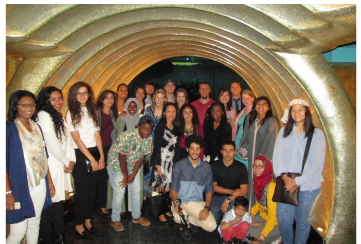
Spring 2016 at Burj Al Arab Hotel

Academic Programs International (API) recently hosted study abroad students to visit the Burj Al Arab. Students toured the the five-star hotel, and viewed the luxurious floors and suites.