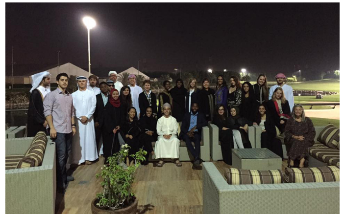
Spring 2016 at Sharjah Golf and Shooting Club

IXO hosted a farewell dinner for Spring 2016 students at the Sharjah Golf and Shooting Club. We hate to see them leave, but wish them all the best settling back at their home universities.