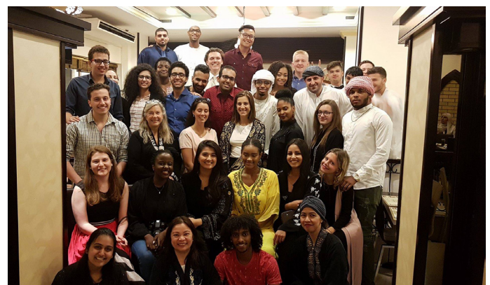
Farewell Dinner at Bait Al Baghdadi

IXO wishes the best to all students and hopes they had a wonderful time at AUS.