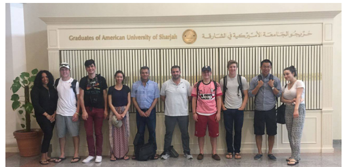
Syracuse students visit AUS

We hope they enjoyed their tour, and their time in the UAE.