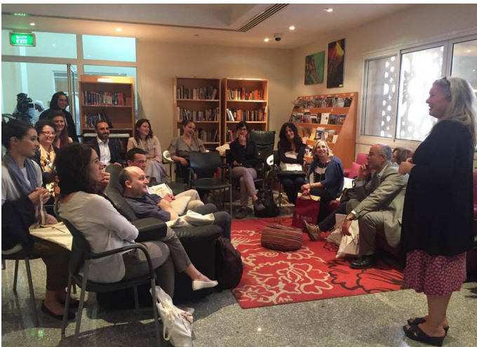
Delegates from Sapienza University at IXO lounge