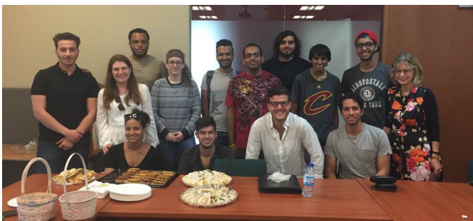
Workshop attendees in SBA

We conduct this workshop every semester and encourage outgoing Spring 2017 students who are returning to join us for the next one.