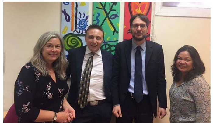
Delegates from Italy at IXO