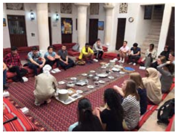
Spring 2016 incoming study abroad students at the Sheikh Mohammed Centre