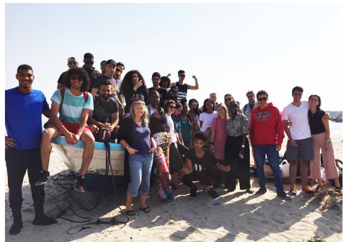
Students at Dibba, Musandam, Oman