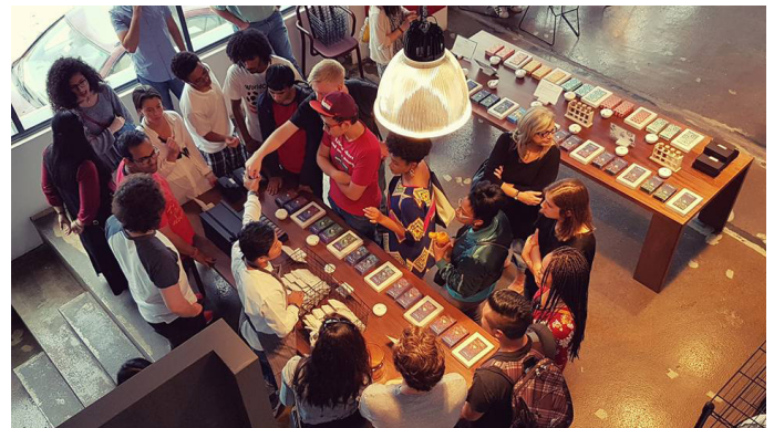
Chocolate tasting in Mirzam

Finally, in mid-March, they had a day-long dhow cruise around the scenic fjord areas of Musandam, Oman, departing from Dibba.