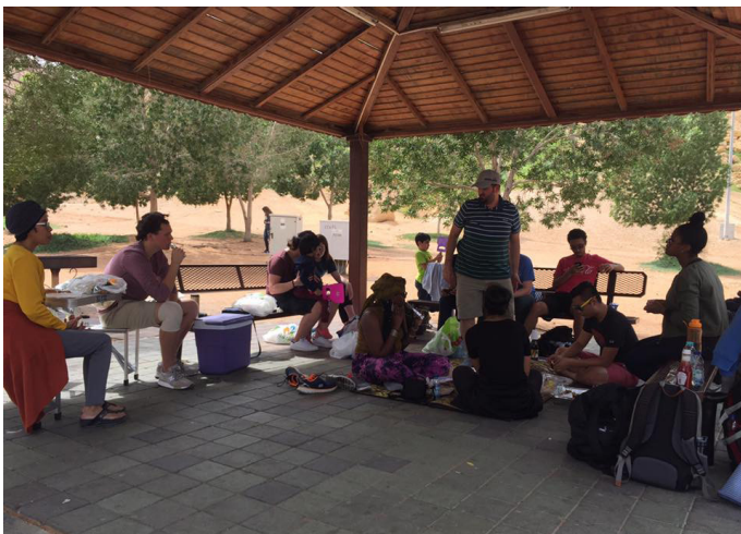
Students barbeque at Hot Springs Park, Al Ain