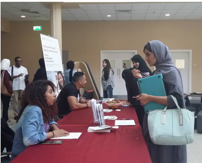
Peer Advisors and AUS students

IXO hosted a study abroad fair in the College of Arts and Sciences Chemistry Building to inform students that studying abroad is more feasible than they might have imagined.