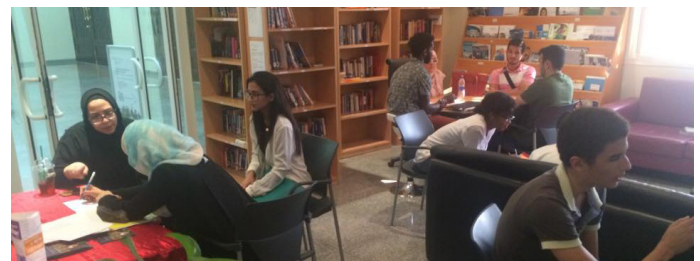
AUS community members participating in a "Language Exchange" session

IXO has been hosting weekly "Language Exchange" sessions in the IXO lounge. These sessions are for study abroad students as well as AUS students and faculty to engage with one another in a variety of languages.