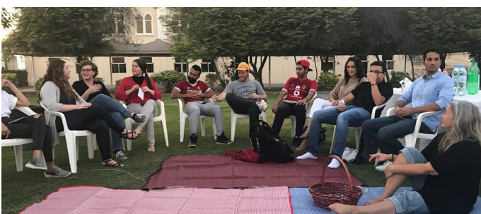
Question and Answer Circle

Every semester, IXO coordinates with the Academic Support Center to offer a Pizza and Conversation evening for IXO students studying at AUS. The event aims to encourage the incoming exchange students to share and discuss questions about life and culture within AUS, Sharjah, the UAE, and more generally, the Arab and Islamic world. We cover so many interesting topics this way!