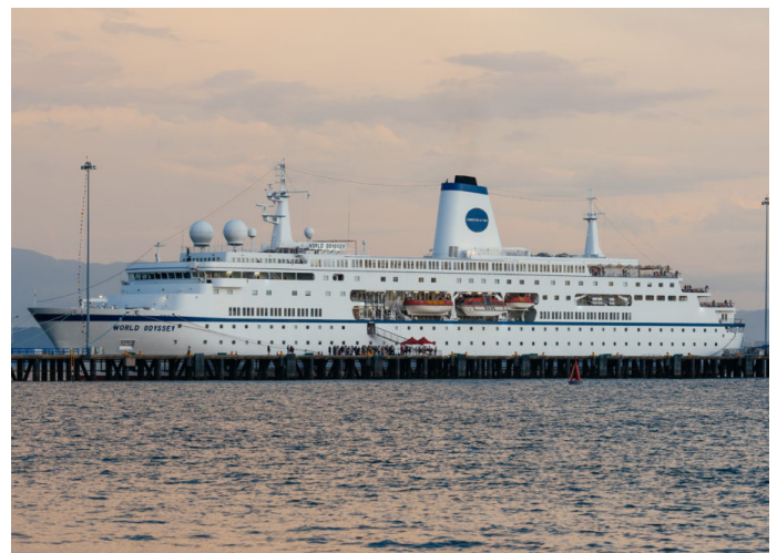
Semester at Sea

For more information, please visit IXO and check the website: https://www.semesteratsea.org/voyages/fall-2018/