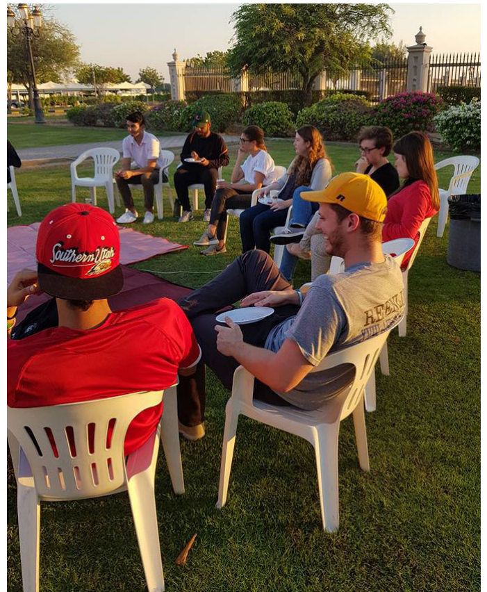
A Moment from Pizza and Conversation