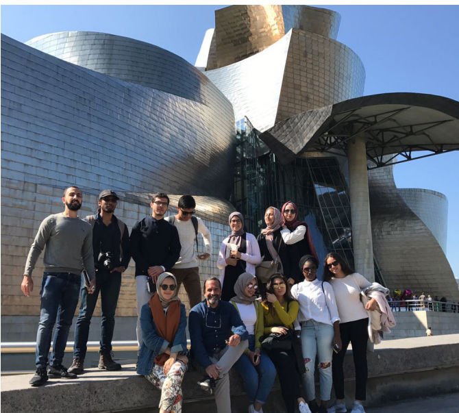
CAAD Class at the Guggenheim Museum, Spain

Latest word indicates they are enjoying the experience to the fullest.