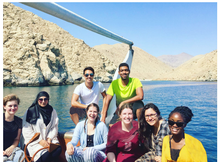
Exchange Students in Musandam, Oman