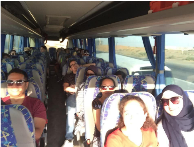
Exchange Students on the Way to Musandam

IXO organized a trip to Musandam, Oman. Study abroad students spent a day of fun and laughter aboard a local cruise departing from Dibba.