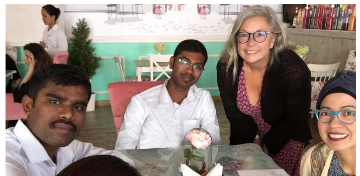
Change in Cleanco Staffing