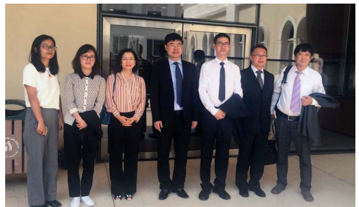
Visiting Delegates from China