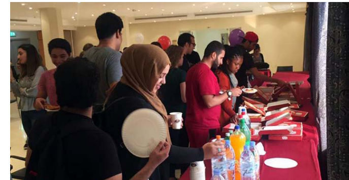
Exchange Students and Guests

The IXO Mixer aimed to facilitate direct interactions between new incoming exchange students and the faculty, staff and students at AUS. The mixer, held in the Main Building, incorporated ice breaker games and a shared meal. Various members of the AUS community attended the event, including students from the Emirati Club, faculty members, and other friends of IXO.