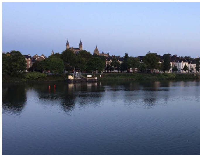
View, Historical Old City of Maastricht