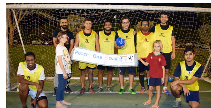
IXO Football Team

IXO exchange students and Peer Advisors participated in a Peace One Day event organized by the AUS Bridge Program. The newly formed IXO team played two matches of football against the Bridge Program teams while other members of IXO cheered them on.