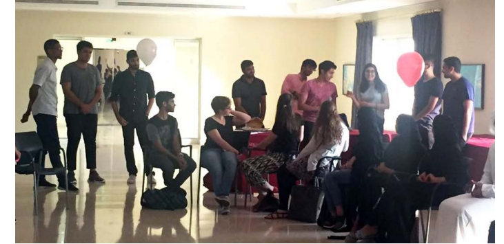
Exchange Students and Guests