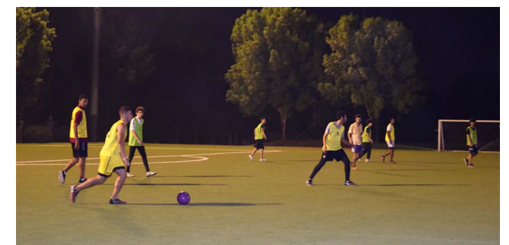
IXO Football Team vs. The Bridge Team