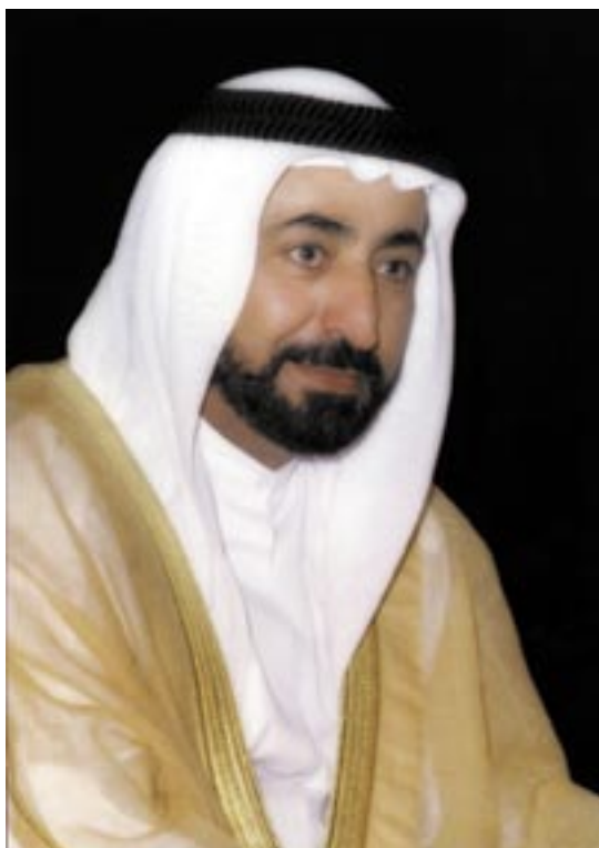
His Highness Sheikh Dr. Sultan Bin Mohammed Al Qassimi

Supreme Council Member, Ruler of Sharjah Founder and President of American University of Sharjah